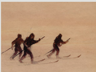
Sketch for Sledge Hauling on Skis, 1903, by Edward Wilson

Booking through the Everyman Theatre (Tel: 01242 572573).